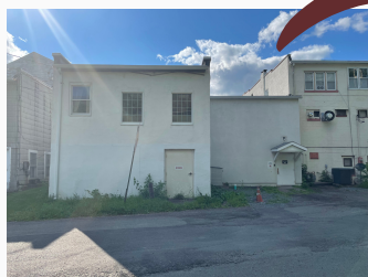
Current rear view of Naples Library