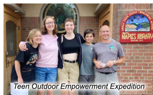
Teen Outdoor Empowerment Expedition

We are so grateful that our community was able to help us and allow us to use their spaces while our building was (and still is!) under construction. Nothing we did in 2022 would be possible without the support of our community.