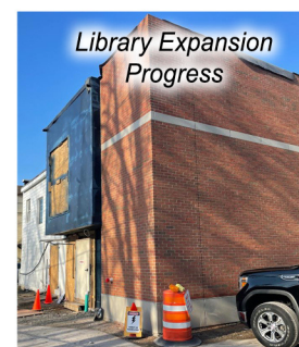
Library Expansion Progress