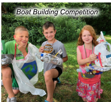
Boat Building Competition

We have so many things to be proud of, from breaking ground on the Accessibility and Expansion Project, finding new ways to continue to serve our community during construction, adding new and exciting programs and more! We are so grateful that we are able to serve the Naples Community and provide services and programs to YOU!