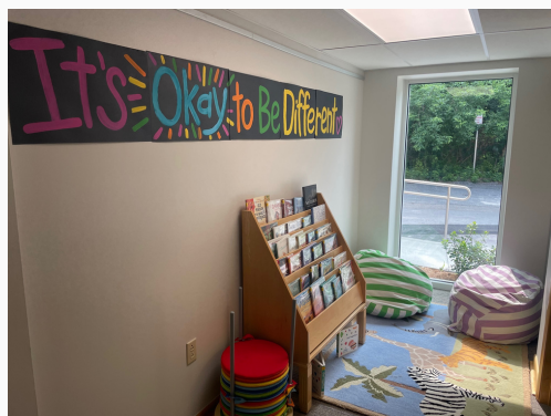
Lower level reading nook, located next to the meeting room.