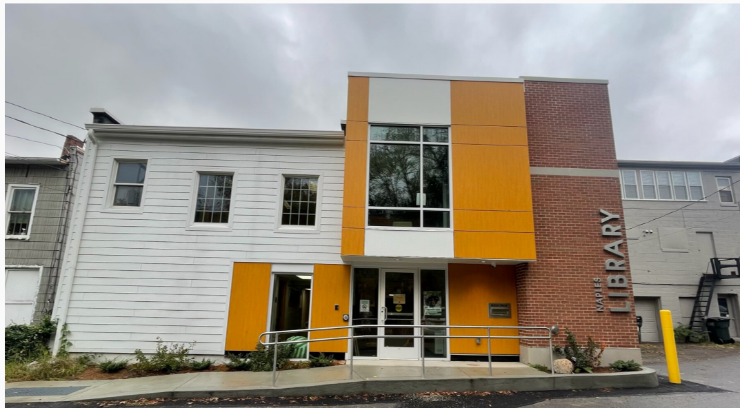
New lower level entrance located on Harwood Lane.

Our project is finally wrapping up! While we are still waiting on a few minor parts to be completed, the large portion of our project is done. The Accessibility and Expansion Project was started to help make our building more accessible by adding an elevator, ADA parking behind the building, and an updated lower level entrance to make entering our building much easier for our community. Other improvements as part of this project included the addition of a space just for teens, a specialized climate control unit in the library archives, a lower level circulation desk and some much needed natural light. This project was made possible with funding from State Aid for Library Construction, the Naples Library Endowment and the Friends of Naples Library. We would like to extend a very big THANK YOU to our community for all of your patience during this project. We appreciate everyone's flexibility and understanding while we were making these improvements. We will be celebrating the grand opening of the new lower level entrance and downstairs lobby very soon, and we sincerely hope you will be able to join us. Details will be released soon, stay tuned!