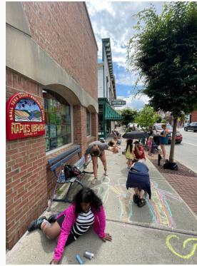
Chalk the Walk