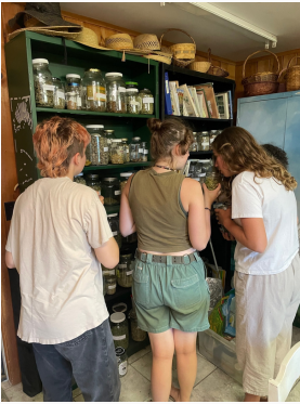
Teen Herbalism Workshop

We would like to thank everyone that participated in our Summer Library Program this year! We had a total of 75 programs with 716 participants throughout the summer. Our Summer Library Program would not be possible without the Friends of Naples Library, our generous community, our many volunteers and our dedicated staff. We are already scheming for next summer, we can't wait!