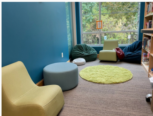
Teen Room, located on the Main Street level

Check out our website for more expansion photos!